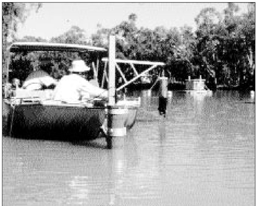
Dr Bradford Sherman and Mr Garry Miller, of the CSIRO Centre for Environmental Mechanics, take measurements near Maude Weir on the Murrumbidgee River.

The research team evaluated four different strategies to manipulate the physical conditions within the weir pool to prevent algal blooms developing. These were by: maintaining an elevated discharge through the weir (between 500 and 1000 megalitres per day), pulsing the weir discharge (increase from 350 to 1500 megalitres per day every three days), releasing water over the weir gate rather than under it, and artificial destratification. The research team also observed that drawing water for human consumption at deep levels of the weir pool reduced the concentrations of algae in the water supply.